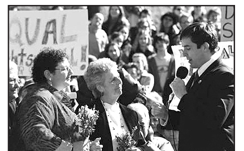
Green New Paltz, NY mayor Jason West solemnizing same-sex marriages in 2005.

The Green Party won't retreat on privacy rights, women's reproductive rights, gay rights (including same-sex marriage), and other rights and freedoms because of pressure from religious extremists and corporations. Many Democrats have compromised on all these issues, and voted for repressive Republican legislation to limit people's rights.