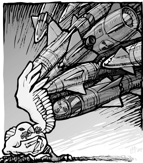
Illustration: Mike Flugelock/D.C. Statehood Green Party

Every election year, Democratic and Republican candidates receive millions of dollars from corporate contributors. As a result, they use their public office to serve the interests of wealthy, powerful corporations instead of working Americans. The greatest threat to democracy today is from the power of corporations, which control everything from our health care to neighborhood development. The corporations already own two political parties—it's time that We the People have our own party.